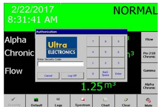
Passcode protected interface

In operation, the SmartCAM continuously monitors Alpha and Beta particulates deposited on a filter with a high efficiency detector. Air is drawn through the filter by an external vacuum pump or distributed vacuum main.