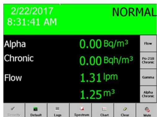
Simple to navigate touchscreen